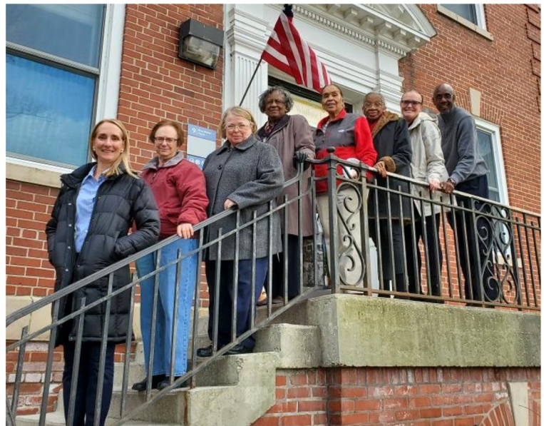
The CMC BPW members standing on the steps of the Mary Walker House at the Veteran's Campus in Coatesville. They just completed visiting the women veterans with food, gifts and making their favorite activity-jewelry.