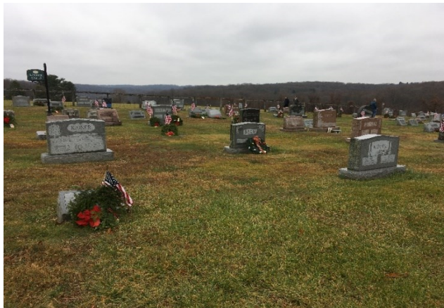
Hopewell UMC Cemetery, Downingtown, PA