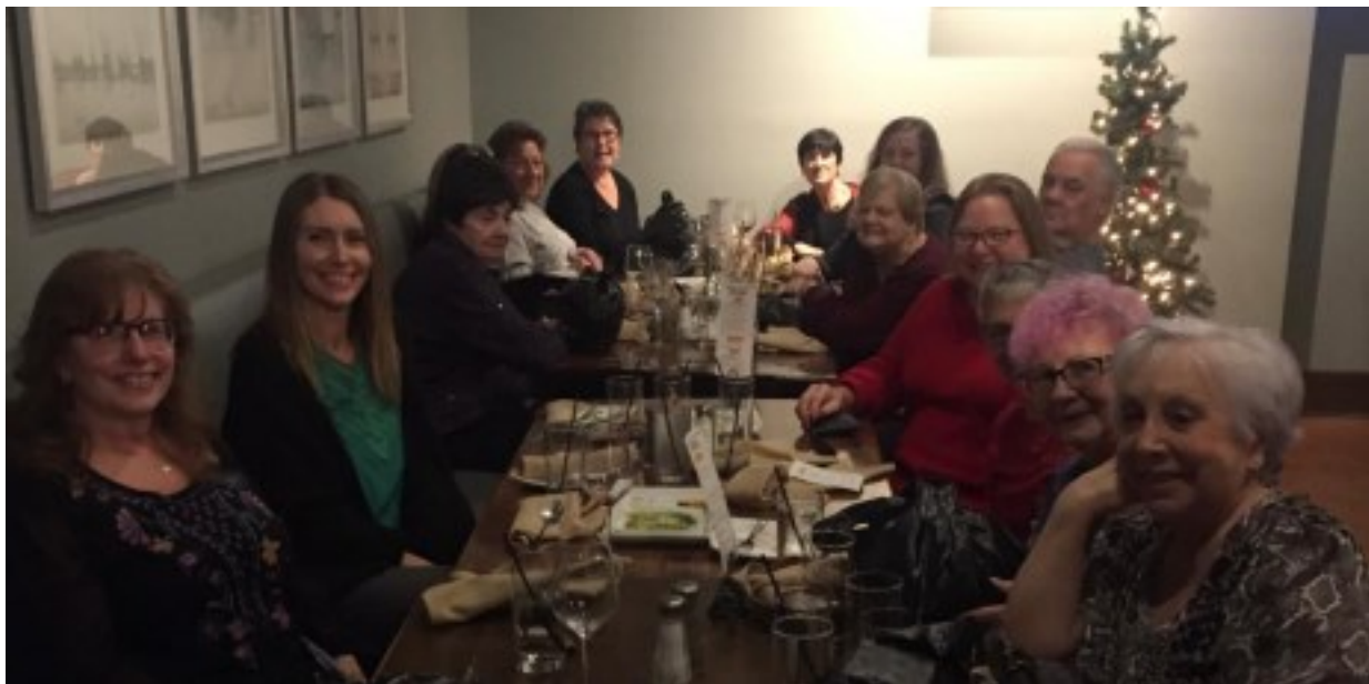
Our Annual Christmas Party was held at Toscana Brick Oven on December 21 st , 2021.