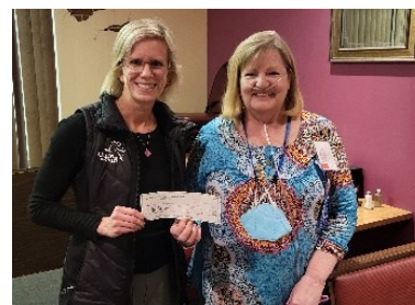
Presentation of check

To date, they have been able to raise $175 to sponsor a girl for the fall 5K race